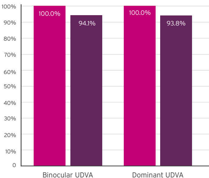
Figure 3. Proportion of binocular visual acuity levels in patients at one month postoperative.