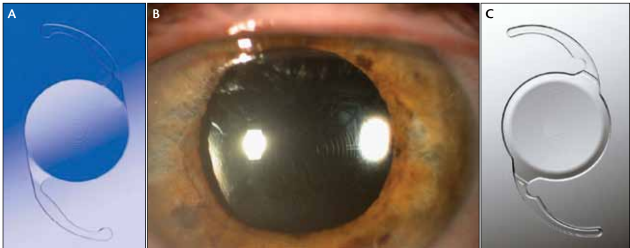
Figure 2. The AcrySof Restor IOL (A,B) and the Tecnis IOL (C) are multifocal IOLs that have diffractive designs.

Mplus (Oculentis) bifocal IOL gives patients good and balanced visual acuity at all distances, even in the intermediate area, and sharp contrast and color vision due to a maximum light exploitation of more than 93%. Furthermore, the minimal halo and/or glare phenomena associated with these lenses make surgeons and patients feel more comfortable than with a multifocal IOL. Additionally, patient satisfaction is still above average at 95%. This lens is promising in select groups of patients. The FineVision IOL (PhysIOL) is a trifocal diffractive lens that provides near, intermediate, and distance foci and, like the Mplus, reduces the amount of light lost to scatter in comparison with other diffractive IOLs.