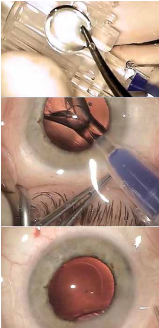
Figure 3. The WIOL-CF is a polyfocal accommodating hydrogel IOL.

bles the natural lens material more closely than other IOLs, making the IOL extremely resistant to protein, cell deposits, and calcification.